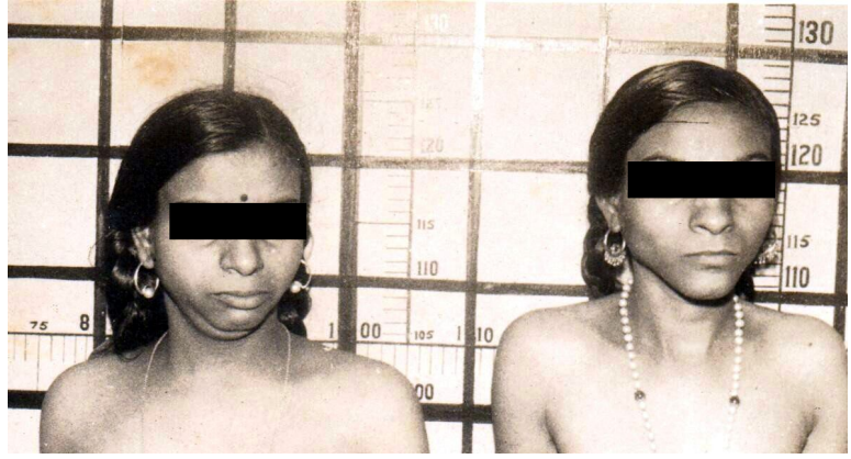
Fig. 1: The sisters with short stature and microcephaly

Chromosome exchange figures(Figure 2d) were occasionally observed Lymphocyte cultures were carried out in TC-199 (folic acid deficient medium) which was routinely used for karyotyping at that time. The sisters had been exposed to diagnostic X-rays for bone age 3-4 days prior to blood collection. The parents, normal sibs and other patients karyotyped simultaneously under the same conditions did not show chromosome breaks or polyploidy. Repeat karyotyping after 3 weeks did not show breaks, though polyploidy was still seen in 20% metaphases in both sisters. Subsequently, chromosome analysis was carried out with various batches of serum, PHA and media, but tetraploidy or spontaneous breaks were not observed. A few months later, karyotyping was done after another X-ray but no chromosome damage was seen, hence the cause of the initial chromosome breakage was not clear.